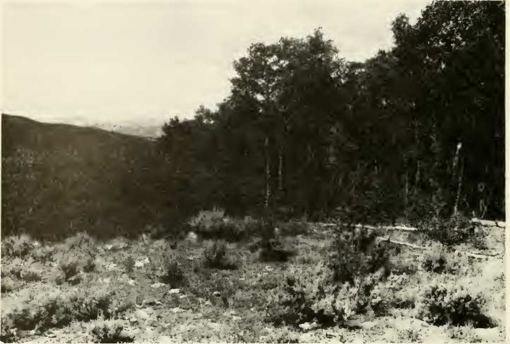
Fig. 2. General views of the three study sites: A, site 1. B, site 2. C, site 3 (next page). Note the sharp contrast between the sprayed and unsprayed portion of each clone.